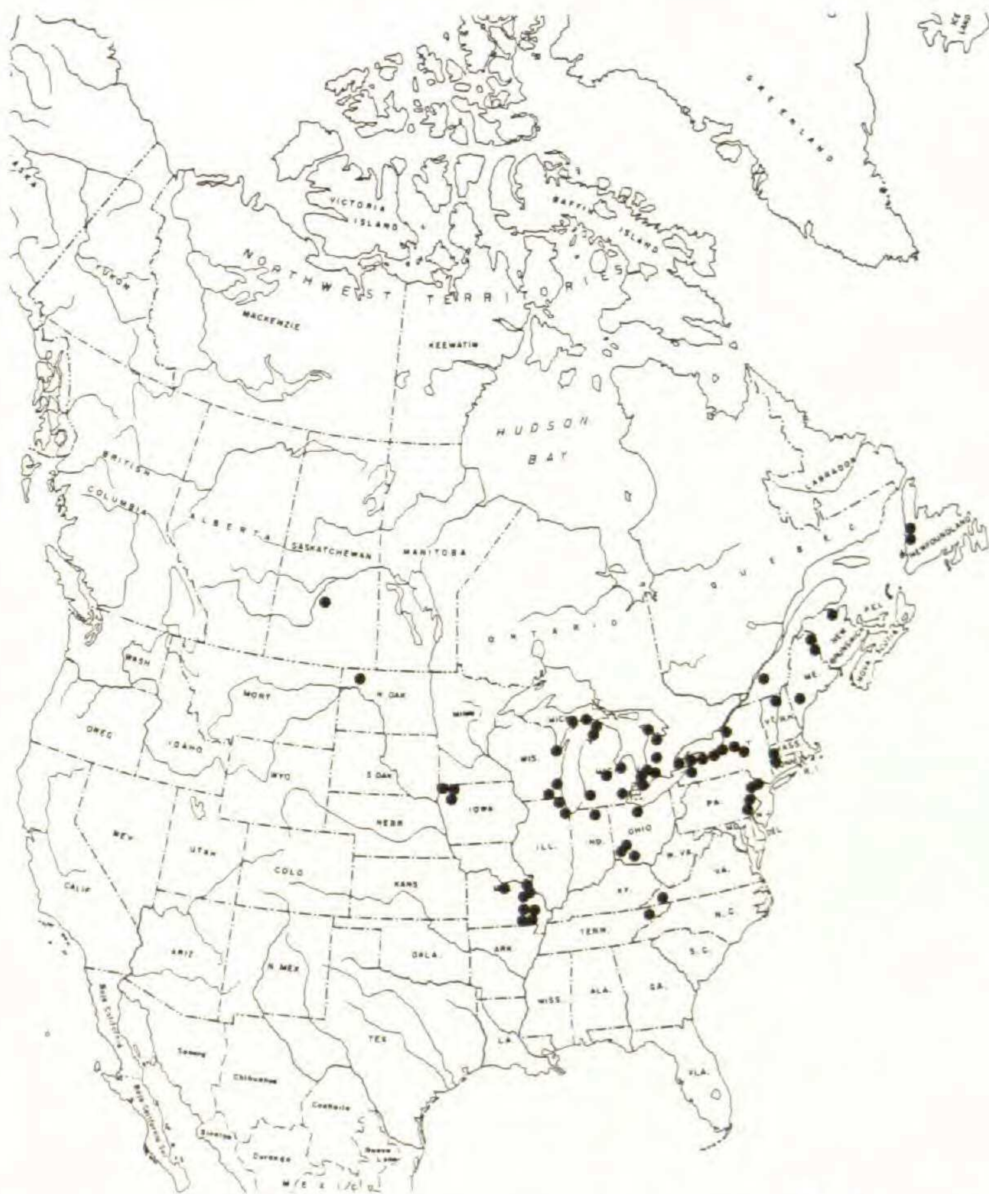
Figure 4. Alleghanian-Ozarkian element: distribution of Rhynchospora capillacea (after Gale, 1944).

occupy its habitat of open limestone ledges partly because, being a trailing woody vine, it cannot compete with typical deciduous forest growth.